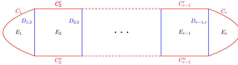
Figure 2. Exceptional divisor E of Type III 1

Note that (iv) implies that there exist points p'_i, p''_i in D_{i,i+1} for 1 \leq i \leq r-1 which are smooth points on D and such that T_E^1 \cong \mathcal{O}_D(-\sum_i (p'_i + p''_i)) .